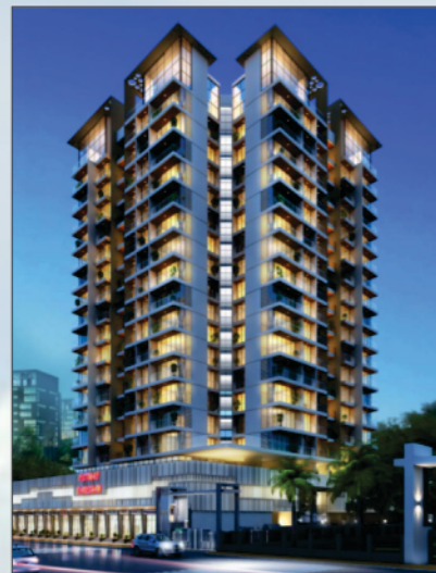
Ostwal Darshan (Bhayandar)