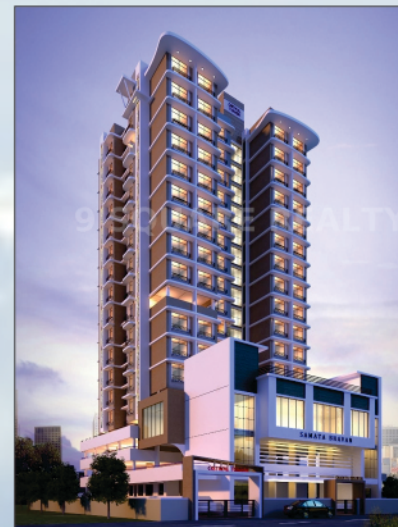
Ostwal Tower (Borivali - W)