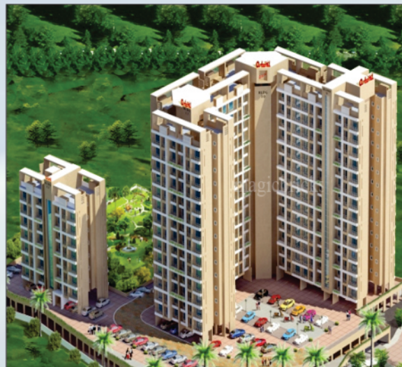
Ostwal Orchid - Phase II (Kanakia Mira Road)