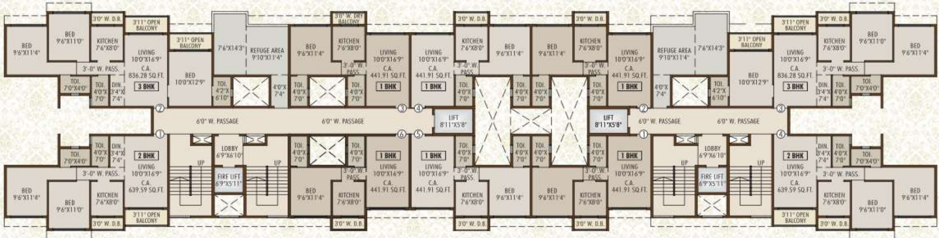
BUILDING NO. 2 (WING - A & B)