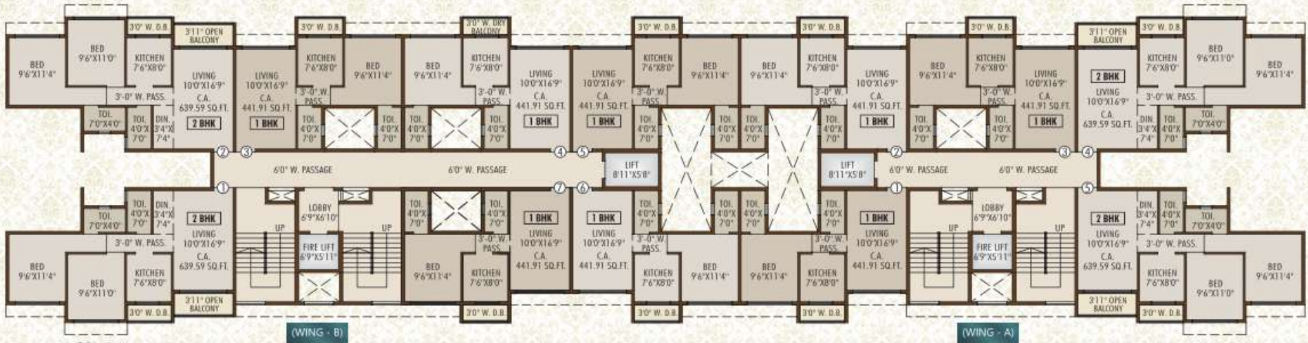
BUILDING NO. 2 (WING - A & B)